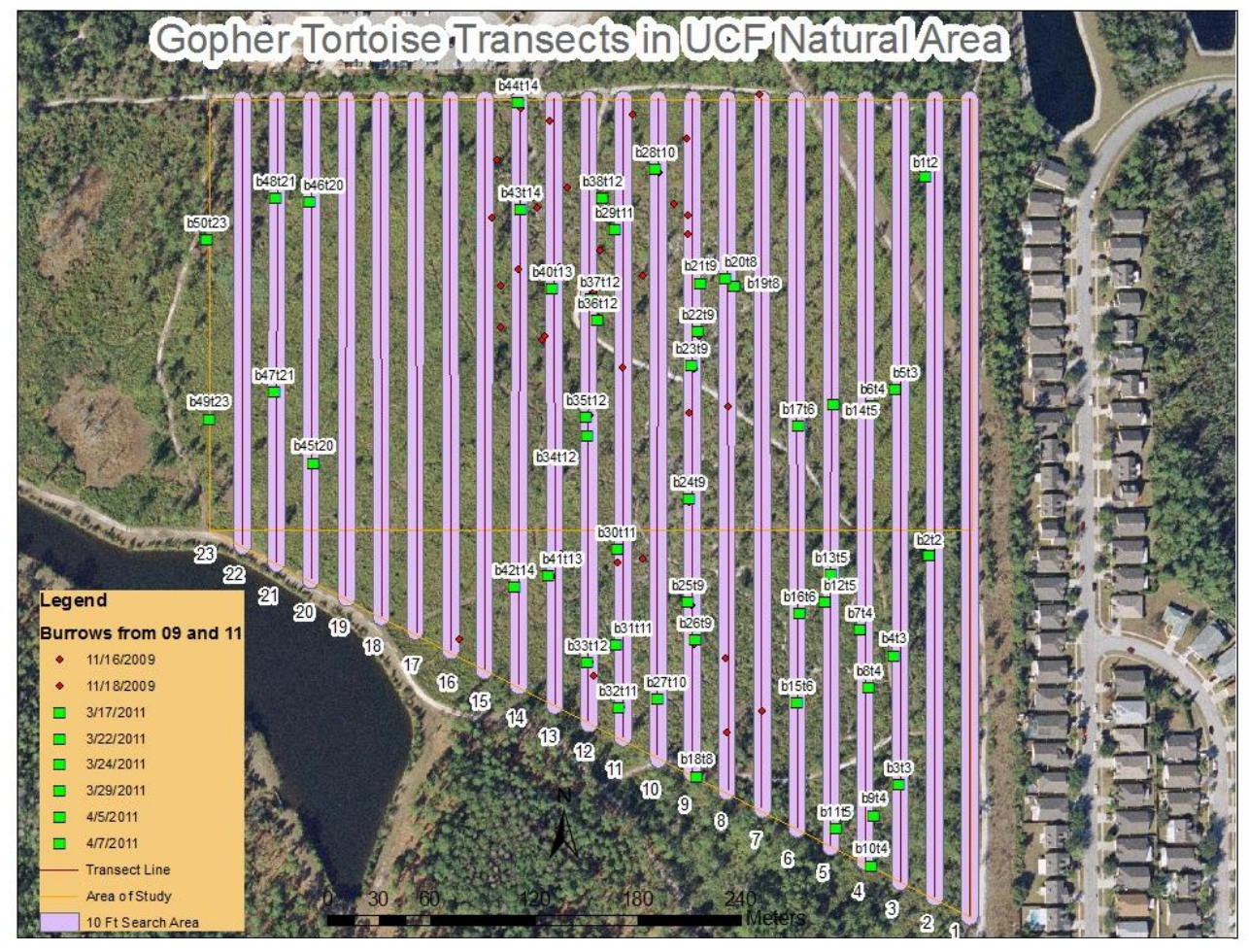
Figure 2 Map of transects and gopher tortoise burrows found in 2009 and 2011