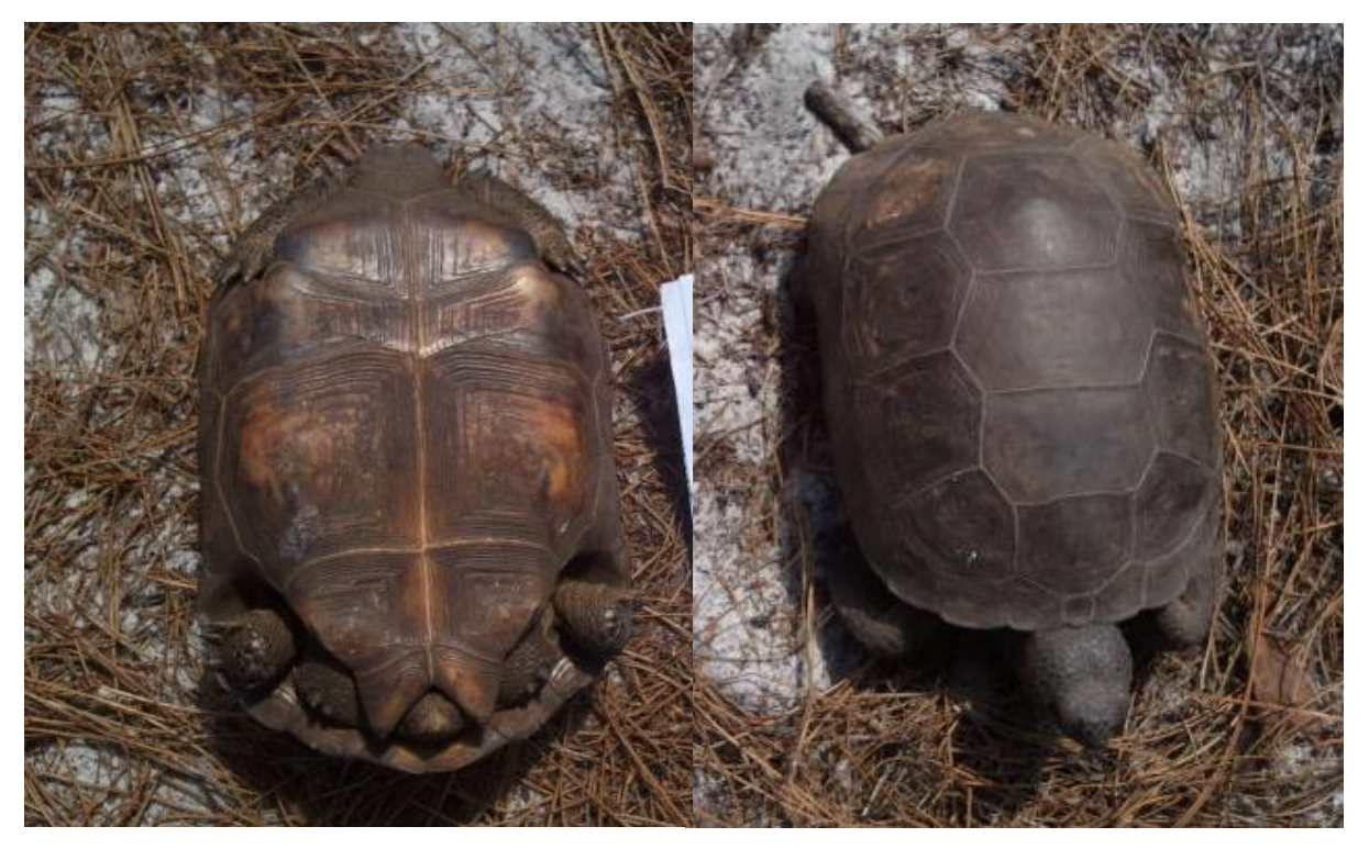
Figure 4 Tortoise #92 found at 2:34 pm on March 22, 2011 in transect 3

Figure 3 Gopher tortoise scute numbering system